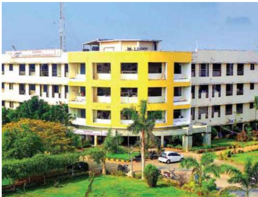
ACET Auditorium Acharya College of Engineering Technology Achariyapuram, Villianur, Puducherry - 605110